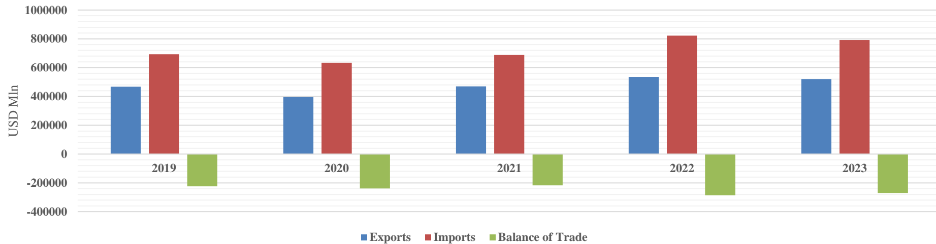
U.K.'s Exports, Imports and BoT 2019-2023