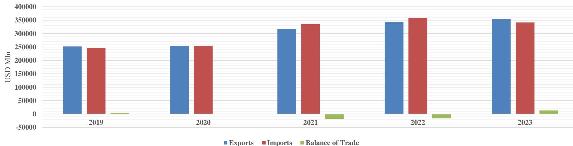
Poland's Exports, Imports and BoT 2019-2023